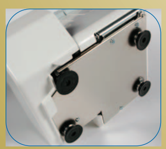
Solid metal base plate keeps machine stable, quiet and smooth running.