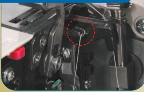
Threading the Lower Looper is a breeze when you have easy access. Just rotate the thread guide and the lower looper thread guides pop into view.