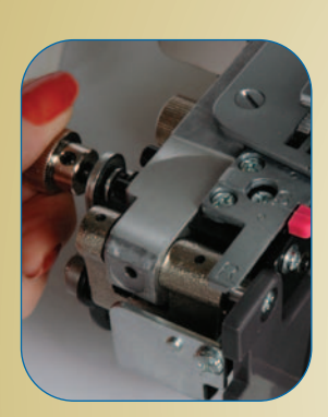
Adjustable Cutting Width.

The Threading Chart and Colour-Coded Guides are easy to follow for 2-thread or 3-4 thread overlocking.