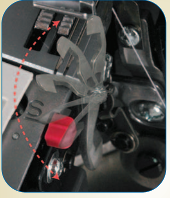
Easily Retractable Upper Knife.