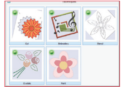
More than just embroidery: Create files for embroidery, paint, crystals, stencil and cutwork.