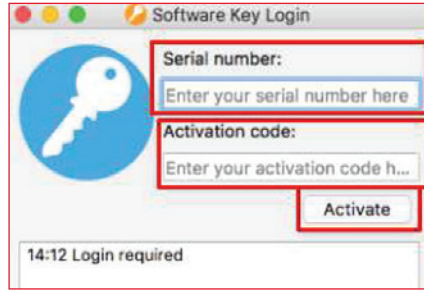
Software key login: Install the software an unlimited number of times, log in to use at any time.