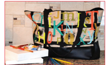
Fonts, Fonts Fonts: Select from True Type Fonts, Open Type fonts, or your system fonts to create unique looks.