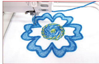
Couching: Add depth, dimension and drama to any project by stitching down yarn.