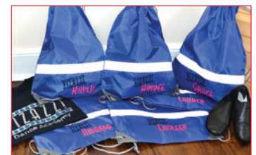
Name Drop: Quickly insert several names in a single design for bags, caps, badges or shirt logos.