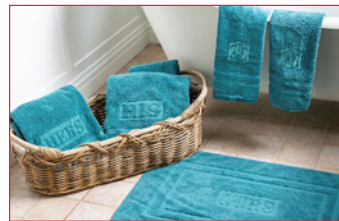
Reverse Lettering: Use alongside Netfill and Trim functions to eliminate bulky satin stitches that could easily get lost on bulky fabric.