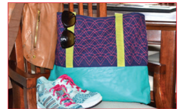
Array: Take a single design and automatically populate it seamlessly into several, covering your stitch area.