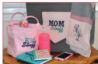
Intertwined Monogram: Easily weave your monogram letters through each other, creating a unique design.