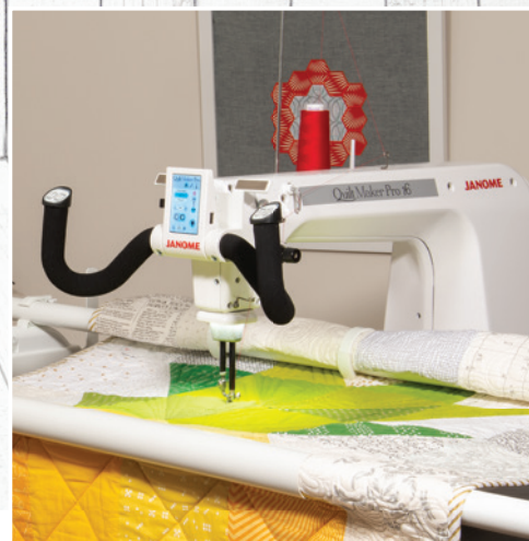
Adjustable Front and Rear Handlebars

*Rear handlebars are an optional accessory