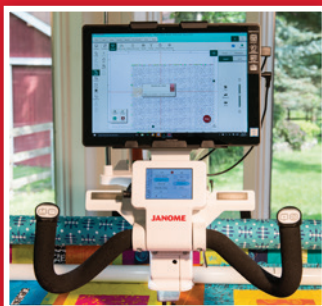
Pro-Stitcher pictured on QMP18

*Rear handlebars are an optional accessory