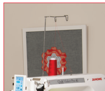
Built-in Thread Stand