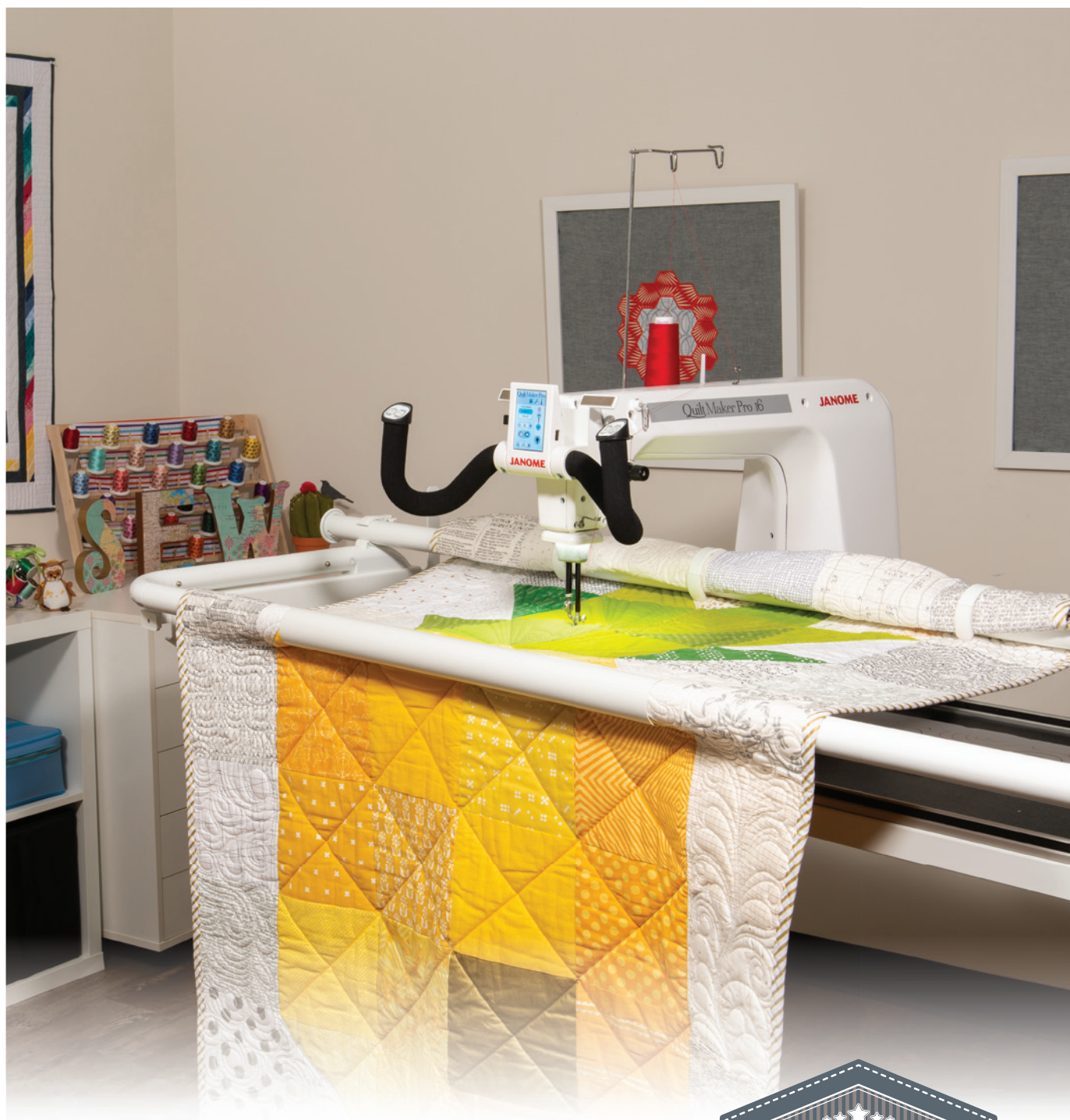
Quilt Maker Pro-16