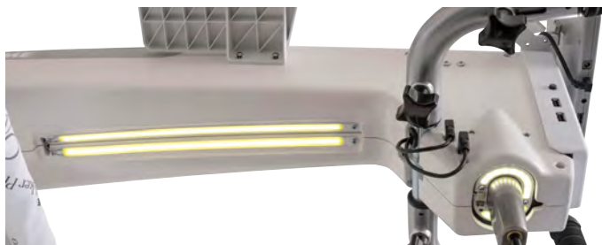
Wide spread LED lighting within inner long arm and needle area + bobbin area