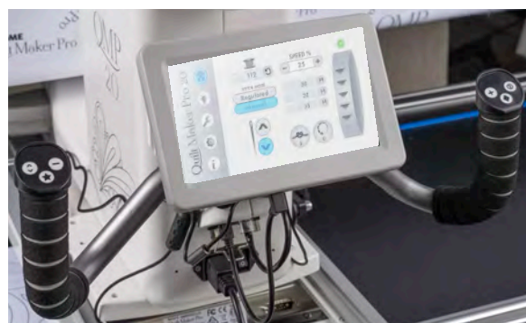
Optional Extra: Rear Handle Bar Kit featuring Colour Touch Screen, Laser for pantograph's, Rear Handle Bars with Start/Stop, Needle Up/Down, Speed Control and programmable buttons