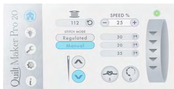
On-screen handwheel control - no longer go to the back of the machine to manually move the handwheel