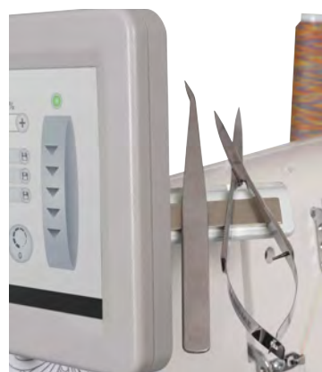
Magnets are positioned on both sides of the front display screen for pins, scissors, etc.